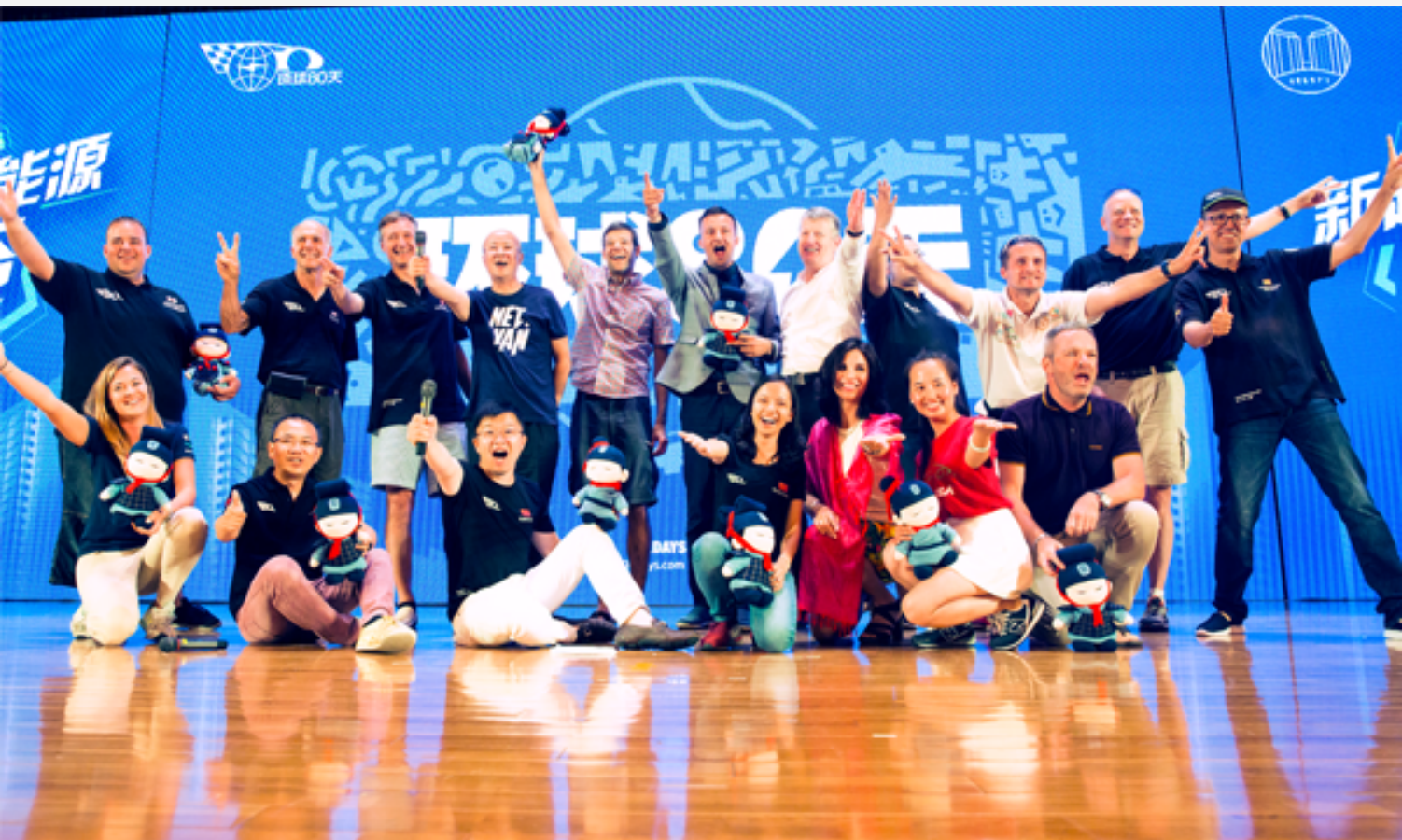
80edays teams 2016

Happyness is strengthening the immune system and there is no better feeling than doing something good, so forget negative vibes, be happy and no Corona will be able to harm you.